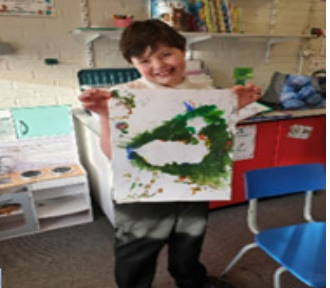
In art this week we have completed where are Duck and Goose? Can you spot them? This is to explore mixing colours and work on cutting out skills.